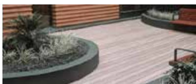
Furniture and design