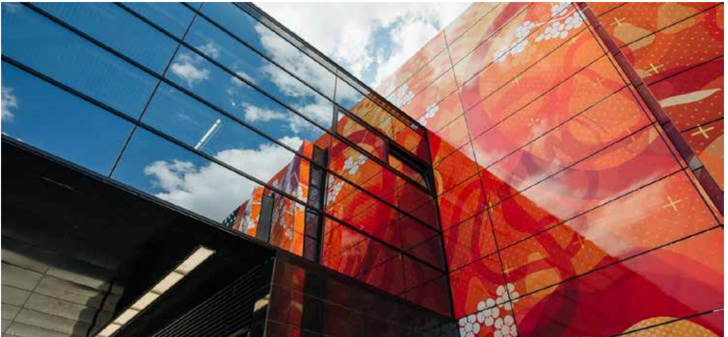
(Michurinsky Prospekt Metropolitana, Mosca)