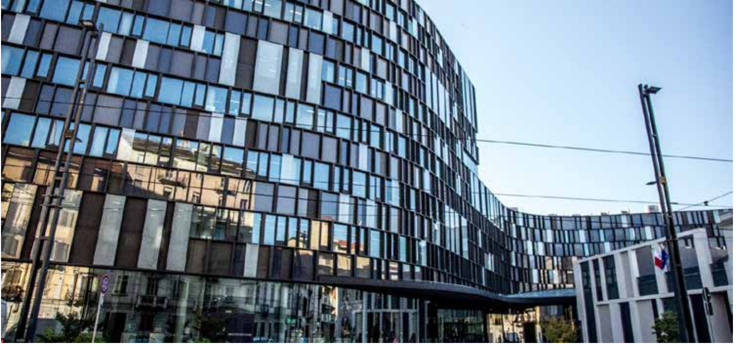
(Nuvola Lavazza, Torino)